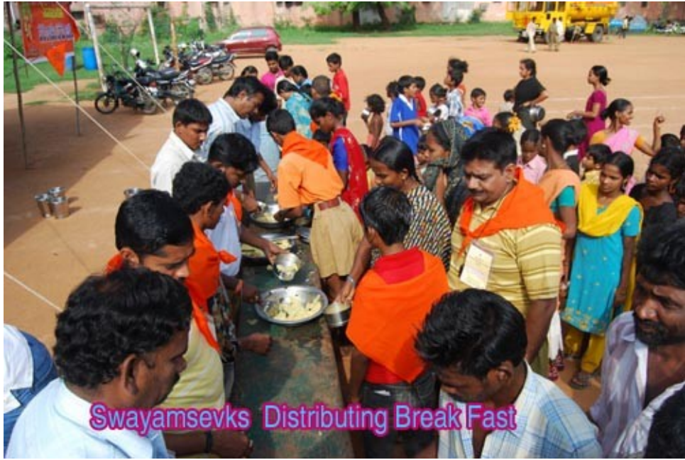
Swayamsevks Distributing Break Fast