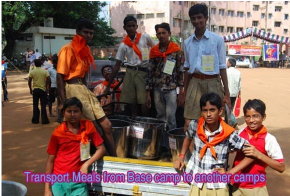
Transport Meals from Base camp to another camps