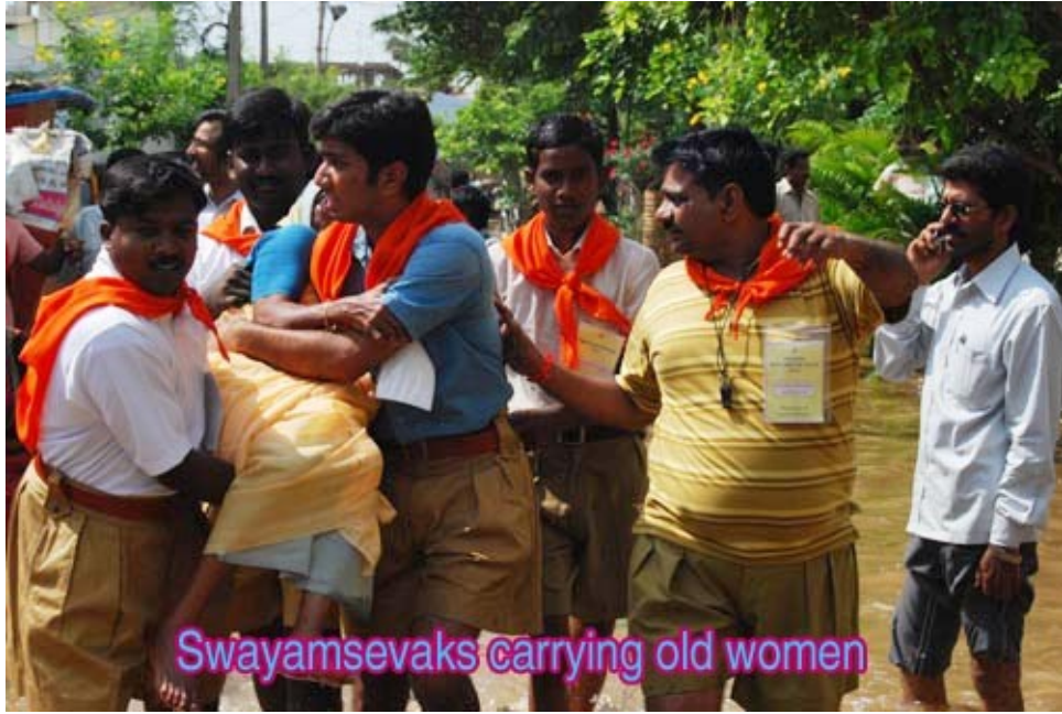
Swayamsevaks carrying old women