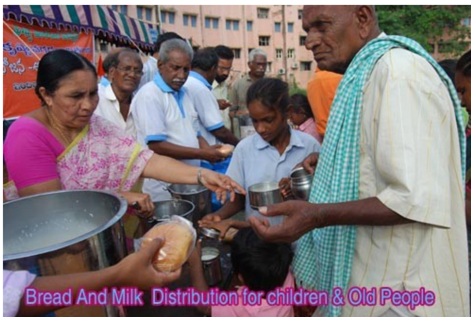
Bread And Milk Distribution for children & Old People